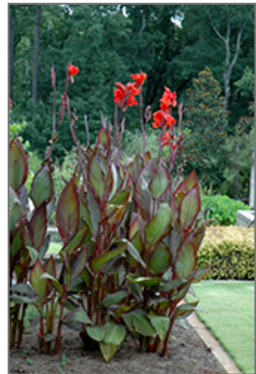
Australia Canna in bloom