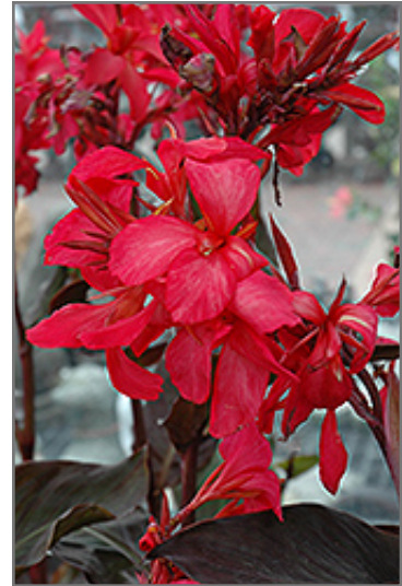
Australia Canna flowers

This plant should only be grown in full sunlight. It requires an evenly moist well-drained soil for optimal growth, but will die in standing water. It is not particular as to soil pH, but grows best in rich soils. It is highly tolerant of urban pollution and will even thrive in inner city environments, and will benefit from being planted in a relatively sheltered location. Consider applying a thick mulch around the root zone in winter to protect it in exposed locations or colder microclimates. This particular variety is an interspecific hybrid. It can be propagated by division; however, as a cultivated variety, be aware that it may be subject to certain restrictions or prohibitions on propagation.