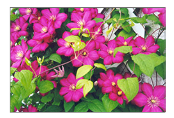
Ville de Lyon Clematis flowers