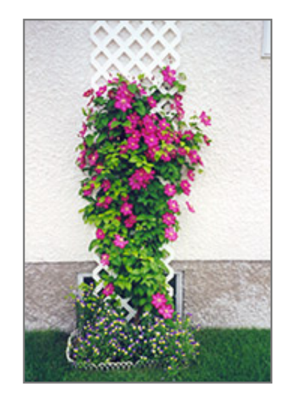
Ville de Lyon Clematis in bloom