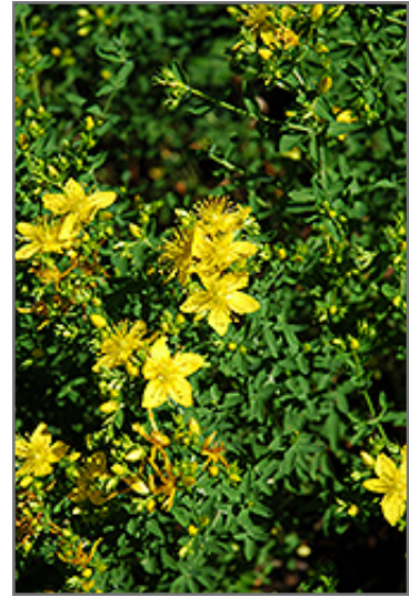
St. John's Wort flowers

St. John's Wort will grow to be about 24 inches tall at maturity, with a spread of 18 inches. When grown in masses or used as a bedding plant, individual plants should be spaced approximately 14 inches apart. It grows at a medium rate, and under ideal conditions can be expected to live for approximately 5 years. As an herbaceous perennial, this plant will usually die back to the crown each winter, and will regrow from the base each spring. Be careful not to disturb the crown in late winter when it may not be readily seen!