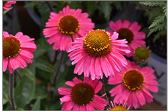
Sensation Pink Coneflower flowers

This is a relatively low maintenance plant, and is best cleaned up in early spring before it resumes active growth for the season. It is a good choice for attracting bees and butterflies to your yard, but is not particularly attractive to deer who tend to leave it alone in favor of tastier treats. It has no significant negative characteristics.