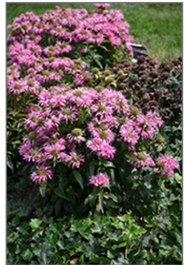
Pardon My Pink Beebalm in bloom