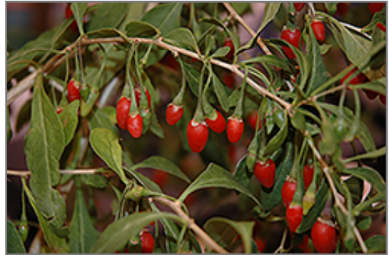
Sweet Lifeberry Goji Berry fruit

Aside from its primary use as an edible, Sweet Lifeberry Goji Berry is suitable for the following landscape applications;