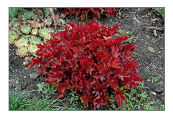
Dolce Cinnamon Curls Coral Bells