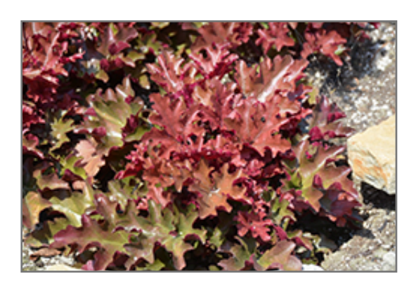
Dolce Cinnamon Curls Coral Bells foliage

Dolce Cinnamon Curls Coral Bells is recommended for the following landscape applications;