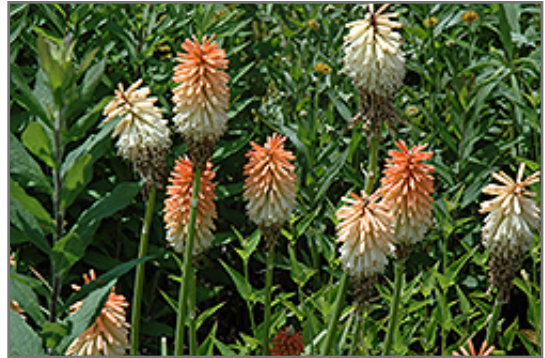
Earliest Of All Torchlily flowers