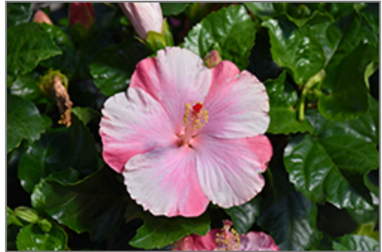
Tye-Dye Wind Hibiscus flowers