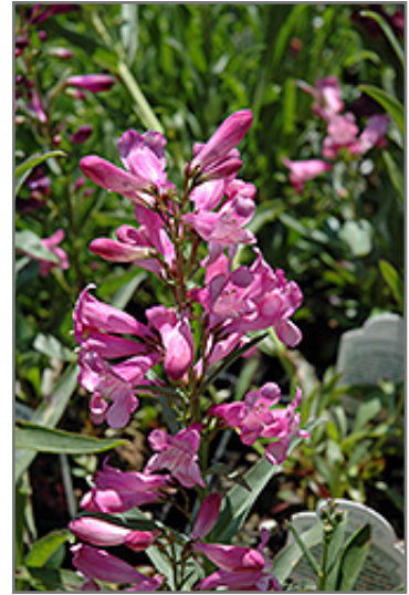
Rondo Pink Beard Tongue flowers