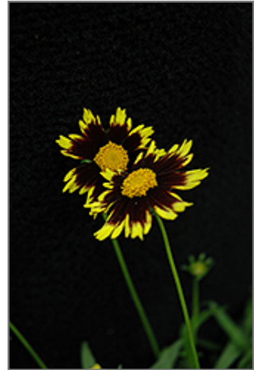
Cosmic Eye Tickseed flowers

Cosmic Eye Tickseed is recommended for the following landscape applications;