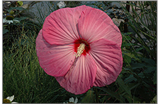
Party Favor Hibiscus flowers

Other Names: Rose Mallow, Hardy Hibiscus